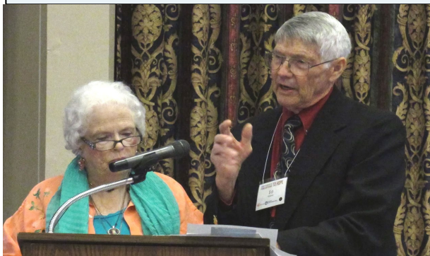
Speaking on March 4 th , 2017 in Madison, Wisconsin, at a conference entitled "From Suffering to Hope"

Mother Teresa's favorite scripture tells it all "Truly I tell you, whatever you did for one of the least of these brothers of mine, you did for me" Matthew 25:40, 45 , (NIV). Oct 31, 2014